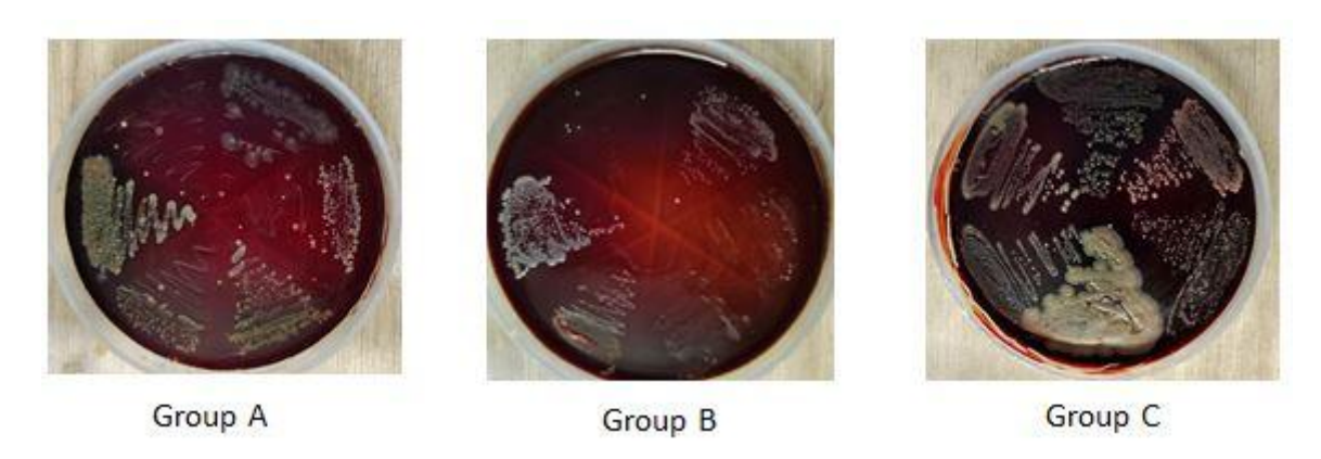
Fig. 2. Comparison of CFUs of three groups after four weeks